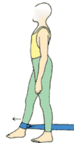
Resisted hip flexion