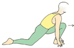
Hip flexor stretch